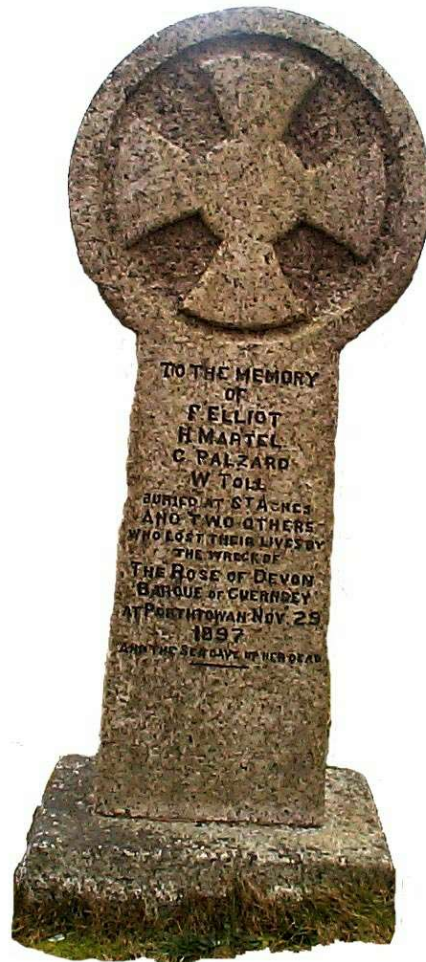
Towl Bedhcryvow Kernow